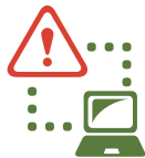
Lack of data validation with ERP

A BROKEN DATA OR COMMUNICATION CHANNEL, FOR ANY REASON, WILL LEAD TO A BREAKDOWN IN SUPPLY CHAIN PROCESSES.