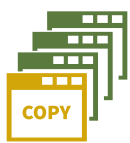
Duplicate data sets