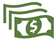
Cost of Labor

IT ALSO BECOMES EASY TO LOSE CONTROL OF OPERATIONAL COSTS, INCLUDING THOSE DIRECTLY INFLUENCED BY INVENTORY LEVELS AND MOVEMENT.